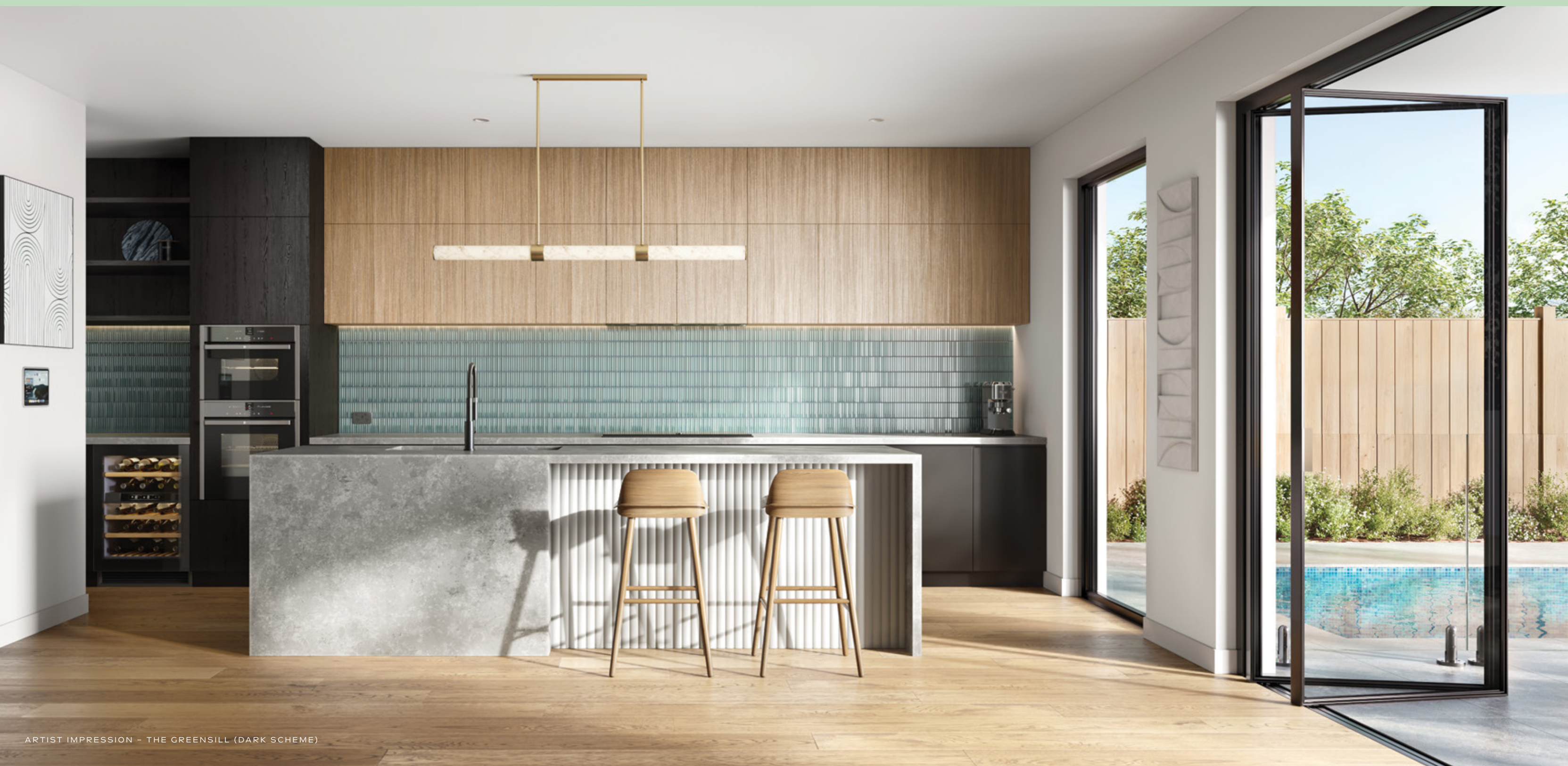
ARTIST IMPRESSION - THE GREENSILL (DARK SCHEME)